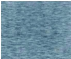
Surface finish: fine-machined and grinded, Ra 0.2µm