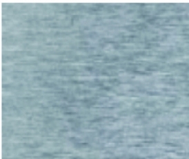
Surface finish: fine-machined and grinded, Ra 0.4µm