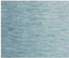
Surface finish: machined, Ra 0.8µm